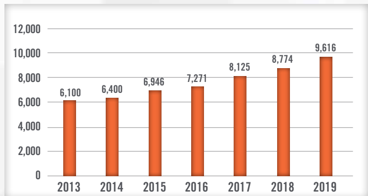
FIGURE 1: NUMBER OF URGENT CARE CENTERS IN THE UNITED STATES