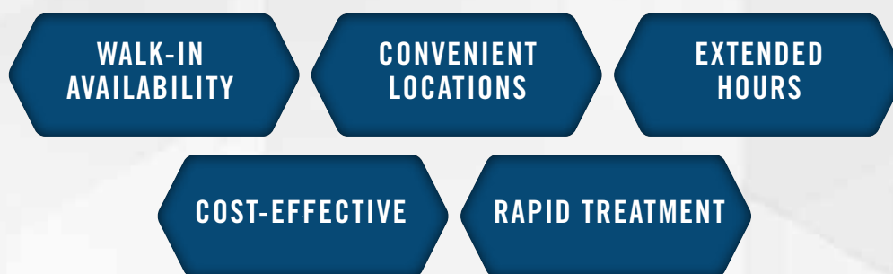
FIGURE 2: PATIENT APPEAL OF URGENT CARE CENTERS

While there are many reasons behind the increase of urgent care centers over the last several years, based on urgent care centers appraised by HealthCare Appraisers, we have noted that changing consumer preferences have been a notable positive impact on this sector. Urgent care centers are increasingly functioning as more than a facility for patients to access a provider quickly, without an appointment, or on evenings and weekends. Increasingly, individuals are using urgent care centers as a replacement for their primary care provider. Adding to the convenience of an urgent care center as a healthcare option is its location. Unlike many physician practices, which are located in large medical office buildings or on a hospital campus, urgent care centers are usually found as freestanding buildings or in open-air shopping malls, resulting in more efficient patient visits. We have observed certain urgent care centers that seek to make the patient experience even more favorable, by focusing on items from comfort and visual appeal of their offices, to technology platforms that result in improved user experience for booking appointments and receiving test results, to cash-pay methods to keep pricing transparency as a focal point.