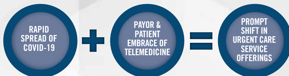
FIGURE 5: COVID-19 IMPACT

Despite challenges, the urgent care industry has attempted to soften the blow of decreased patient volume. Many centers have embraced COVID-19 testing at their facilities, which is a test that cannot be done via a telemedicine visit. Additionally, many urgent care operators have added telemedicine offerings to stay competitive during the pandemic. Experity, a company that provides software programs for the urgent care industry, launched a telemedicine application for the industry in March, up from its original launch date that was planned for the end of 2020. Experity also produced a COVID-19 testing app in three days, which was launched in March. In a survey by the Urgent Care Association of approximately 1,100 urgent care centers, 85 percent responded in May 2020 that they were providing telemedicine services, up from 29 percent in 2019. iii